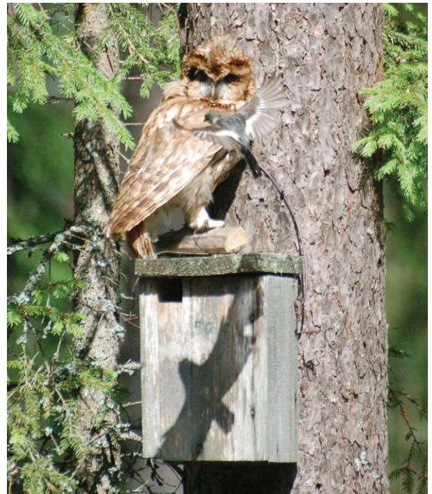
Figure 1. A male pied flycatcher mobs a stuffed tawny owl. The mobbing flycatcher appears as a shadow. (Online version in colour.)

In both treatments, we captured birds breeding in the 'neighbour' nest-box at the end of the nestling phase using mist-nets. We kept these birds in a cage under a hide while a stuffed tawny owl ( Strix aluco ) was presented at the focal nest-box 30 min after the capture of their neighbours. It was mounted near the nest-box and placed between the two neighbouring nest-boxes when no flycatchers were detectable in the vicinity. We presented the owl for 15 min after which we removed it. In the defecting-neighbour treatment, we played back neighbour alarm calls that were previously recorded with a Sony PCM-D50 recorder, because pied flycatchers always give alarm calls when they detect a potential predator in the vicinity of their nests. As soon as the captured birds were released, they resumed feeding their nestlings within 10 min. We observed and evaluated the behaviour of flycatchers